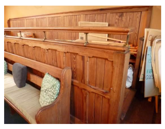
Statement of Significance

The 1899 meeting house is an attractive late Victorian building that retains a little altered exterior and has some good quality original internal fittings. It contributes to the street scene in a part of Colwyn Bay that developed in the late nineteenth century