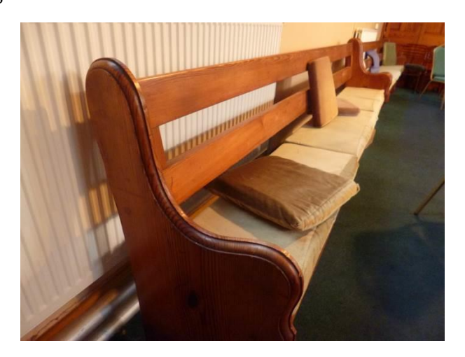
Fig.4: pine benches, probably contemporary with the meeting house

The meeting house contains a set of five pine benches with curved bench ends and plain horizontal rails to the backs; these are now set against the walls of the main meeting room and loose chairs, arranged in a circle, are used for meeting for worship. There are two pine book cases, provenance not known.