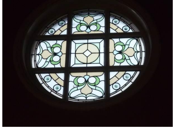
Fig.2: interior details: brass door fittings (left) and stained glass in a meeting room window (right)